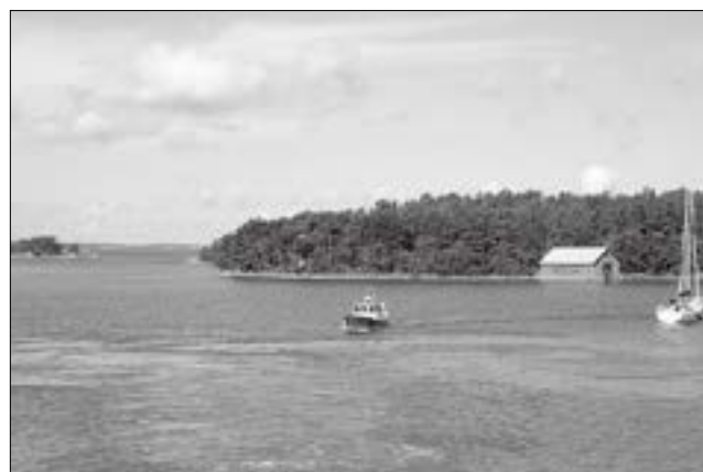
Figure 2. Finland's archipelago is a popular area for boating although blooms of cyanobacteria, a sign of eutrophication, are common during summer.