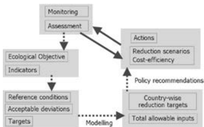
Figure 1. Eutrophication management cycle of the Baltic Sea Action Plan.

Based on the eutrophication targets and using models that incorporate data on pollution loads, hydrology, chemistry and biological parameters, it has been possible to define maximum allowable nutrient inputs to each sub-basin and provisional country-wise annual reduction targets for nitrogen and phosphorus. These figures were adopted by the Baltic Sea countries and the EC, together with a framework of cost-effective actions and measures to reduce nutrient inputs to the Baltic Sea