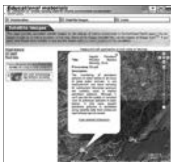
Searching satellite images on map

images and learn basic geographical information of the neighboring area. CEARAC is planning to add more materials in the 2010-2011 biennium, and provide up-to-date information the NOWPAP region.