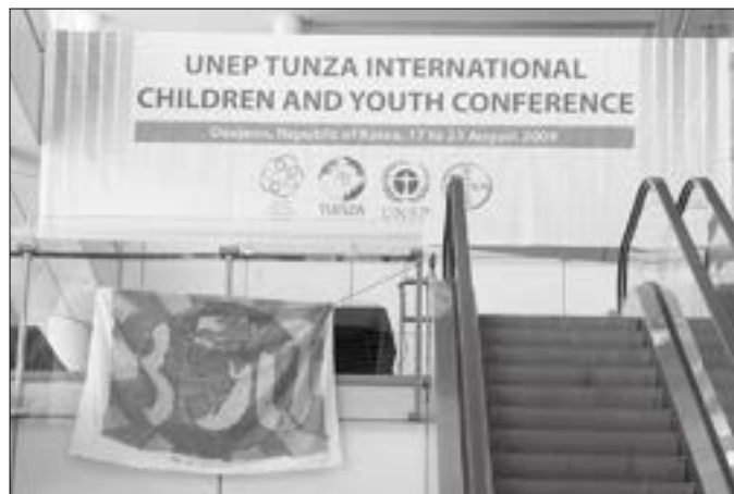
2009 Tunza International Children and Youth Conference