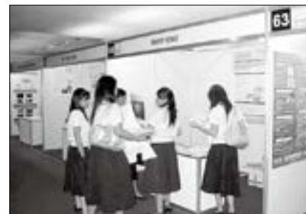
The East Asian Seas Congress 2009

RACs and NOWPAP RCU, and we ask for your support to our activities to protect our mother nature.