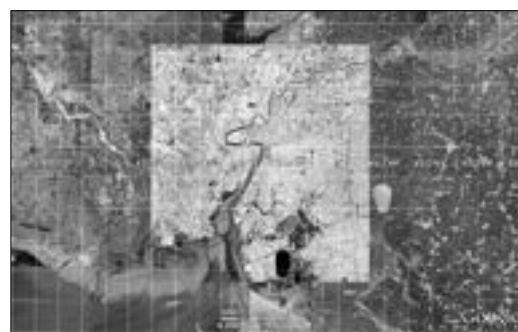
Mapping satellite images on Google Earth