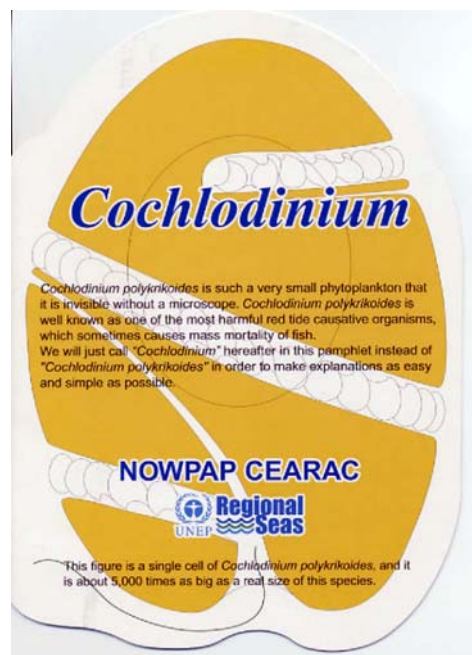
Figure 4. Cochlodinium Pamphlet

Based on the Cochlodinium homepage, the Cochlodinium pamphlet was published at the end of 2005. The pamphlet was made to advertise the NOWPAP CEARAC activities and Cochlodinium homepage, and to provide basic information on Cochlodinium for interested students, NGOs and public. The image of the pamphlet is shown in Figure 4.