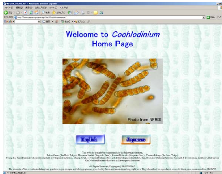
Figure 3. Front page of the Cochlodinium Homepage (http://www.cearac-project.org/wg3/cochlo-entrance/)