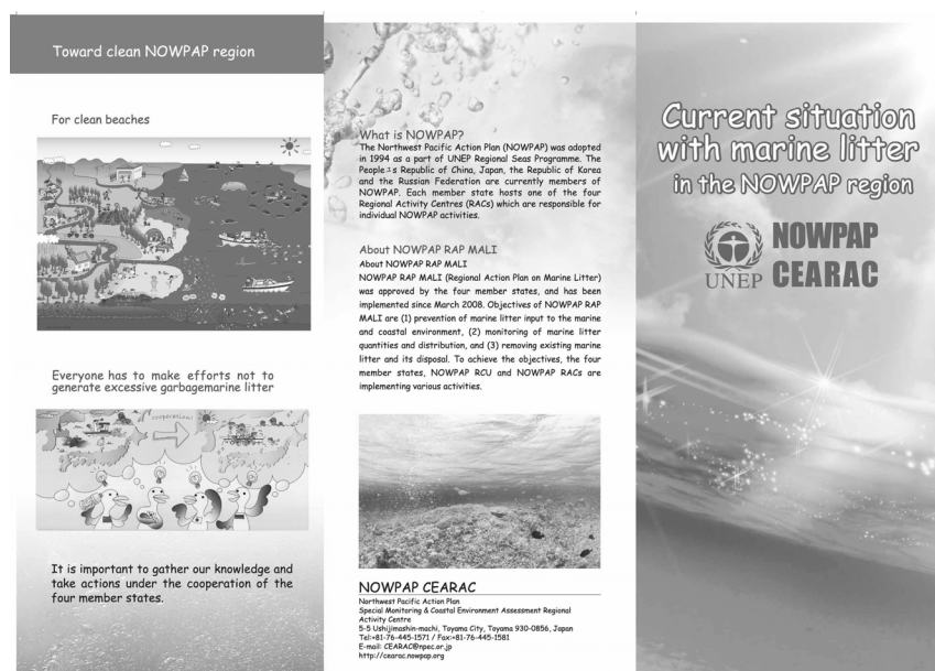
Pamphlet of marine litter

CEARAC developed a public awareness material in cooperation with NOWPAP RCU, in order to decrease the generation of marine litter, using existing outputs of CEARAC and NPEC.