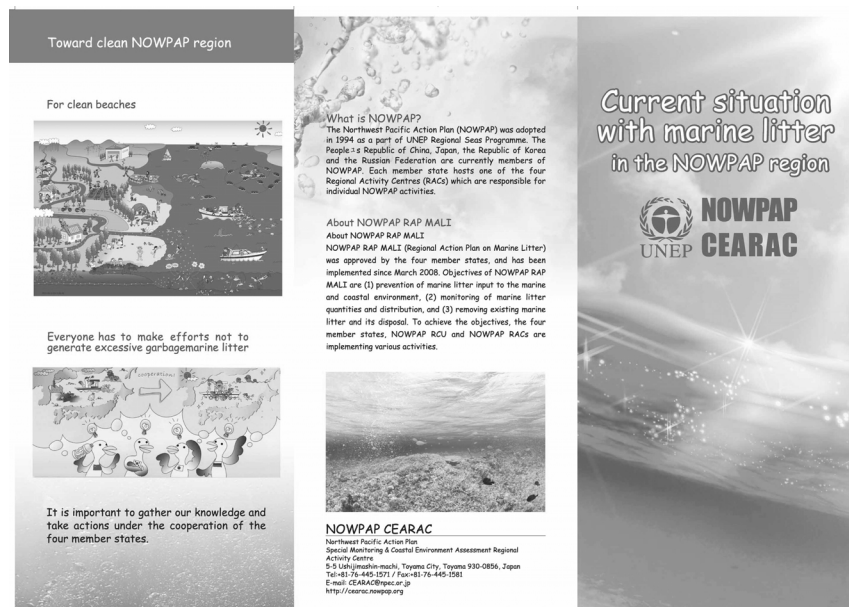
Pamphlet of marine litter

CEARAC developed a public awareness material in cooperation with NOWPAP RCU, in order to decrease the generation of marine litter, using existing outputs of CEARAC and NPEC.