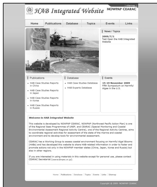
Top page of the HAB Integrated Website

The objective is to provide and share HAB-related information as a whole in order to enhance activities against HABs in the NOWPAP region. CEARAC contracted with consultants for developing HAB Integrated Website and making rules for updating the website itself and the information in it. The draft website was reviewed by CEARAC FPs and WG3 experts. The official operation started in November 2009.